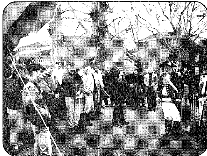
Part of the crowd of about 100 who witnessed the Dedication and Blessing of the Cemetery restoration.