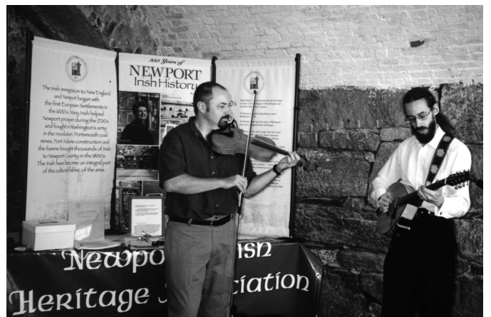
Members of the Publicans play for the crowd in front of Museum and Heritage displays.