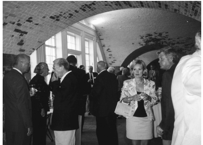
Some of the guests gathered in the North Casemate.

Overall, the September 10th event raised about $2000 for each organization. The Funds will assist the Heritage Association with its annual Irish Heritage Month celebrations in March, and monies raised will help the Museum's program of providing educational materials for Newport County's middle and high schools.