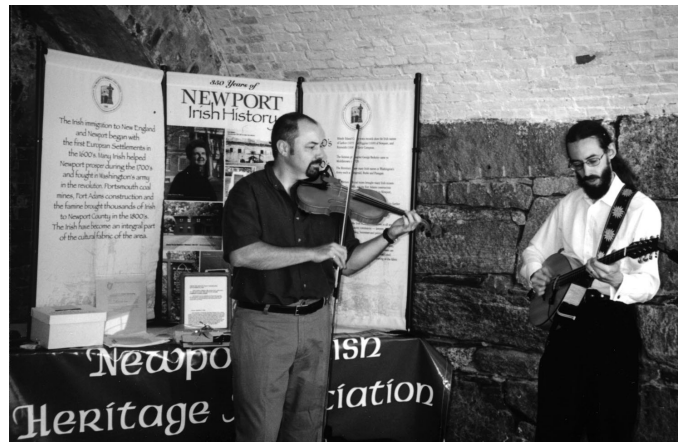
Members of the Publicans play for the crowd in front of Museum and Heritage displays.