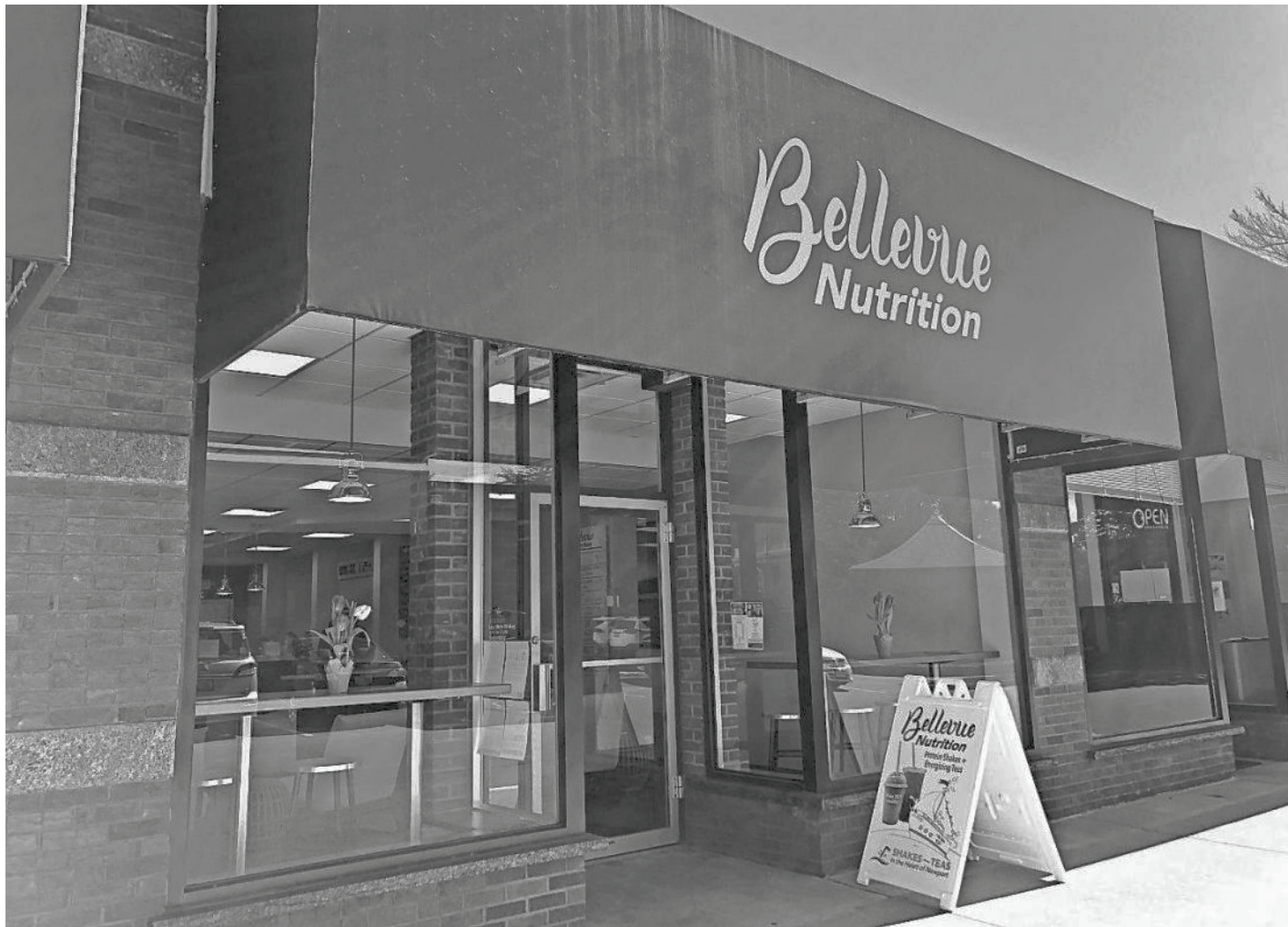
Bellevue Nutrition opened in December. SAVANA DUNNING/DAILY NEWS PHOTO

Savana Dunning Newport Daily News USA TODAY NETWORK