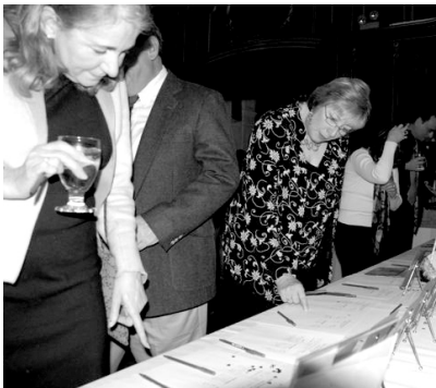
Attendees view Silent Auctions items.

If you were unable to attend the event, a donation in any amount in support of the Interpretive Site Fund would be appreciated. Your tax-deductible donation may be made via check payable to "MNIH" ("Interpretive Site Fund" in the notation section), or by visiting the Museum website ( www.NewportIrishHistory.org ) and clicking on the "Donate" button. During the "Review your Payment" step, type in "Interpretive Site Fund" in the "Special Instructions to Merchant" click-on option. Thank you for your support.