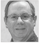
Backyard and Beyond Todd McLeish Columnist

It happened again. We had another crazy winter that alternated between heavy snowfall, record-breaking warmth, and icy cold temperatures, which is once again causing us to question how we define winter weather in New England.