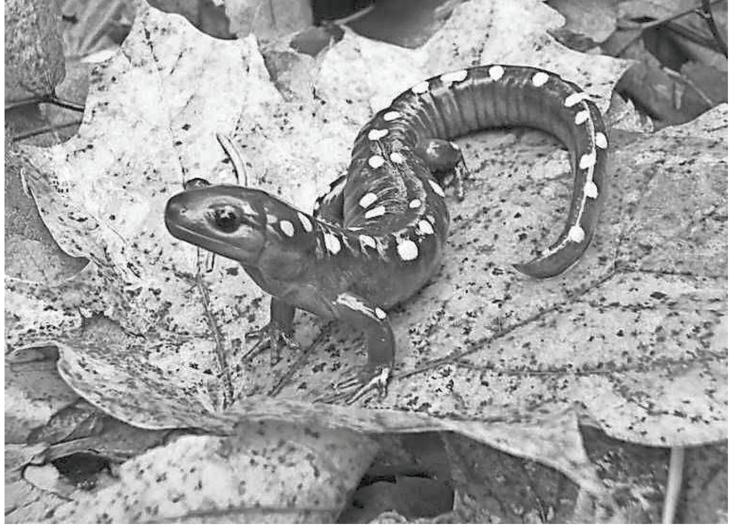
A spotted salamander.

It's not just the vegetation that's getting an early workout from the unusual swings in winter temperatures, however. Some animals are likely struggling, too.