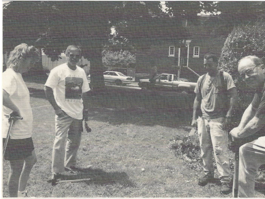
Above: Digging where broken tombstone mount was found