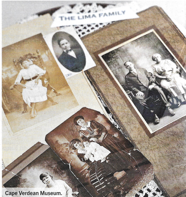
Cape Verdean Museum.

If you're looking for a luxurious weekend away, head to Hotel Viking in Newport or the opulent Océan House on Watch Hill. Or if you're craving summer vibes in the heart of winter, plan a visit to the Surf Shack Bed and Breakfast in Narragansett. hotelvikings.com ; oceanhouseri.com ; surfshacknarragansett.com