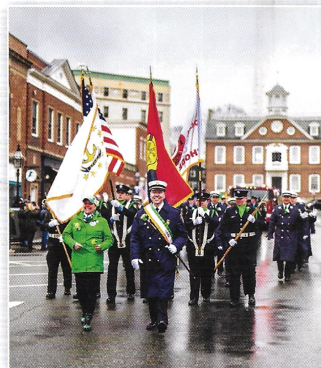
THE PARADE MAKES ITS WAY THROUGH WASHINGTON SQUARE IN 2023.

For more information visit NewportIrishHistory.org