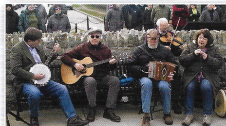
A GATHERING OF MUSICIANS AT 40 STEPS. (LEW ABRAMSON)

Visit NewportIrishHistory.org/Events for details and updates.