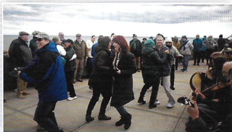
DANCING AT THE 40 STEPS IN 2022.